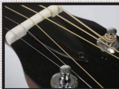
■ The beautiful truss-rod cover is just one example of the attention to detail here