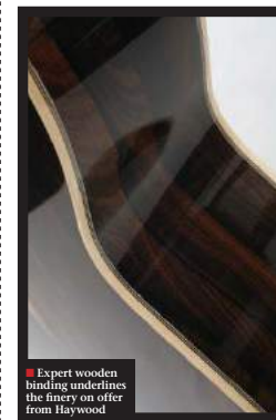
➤ Expert wooden binding underlines the finery on offer from Haywood

an uncompensated bone saddle; it's staunchly traditional and works just fine. Bone is also used for the top nut and the overall finishing and attention to detail are excellent. The myriad bone-substitutes around work well enough, but as far as many guitarists are concerned, bone equals tone, having in our opinion a better fundamental sound than the somewhat more zingy-sounding man-made substitutes.