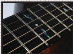
■ Again, taste is the order of the day here. Inlays are pretty, but not ostentatious