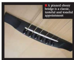
■ A pinned ebony bridge is a classic, tasteful and toneful appointment

The ebony fingerboard graces the notes with a distinctive percussive 'ping' but the Haywood doesn't sound thin or tinny, it simply cuts through with a clear authoritative tone that's