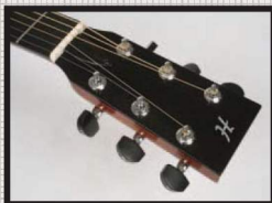
■ Sharp edges have echoes of Collings in the headstock department

EXCEPTIONALLY WELL MADE AND UNIQUE. THIS IS A BEAUTY